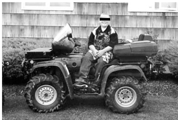
Figure 1 12 year old child on an all-terrain vehicle.

Spinal injuries, although uncommon, were significantly more frequent from ATV related incidents than bicycling, while bicycling and dirtbiking resulted in comparatively higher rates of upper extremity trauma. Compared to ATVs, bicycling resulted in 1.6-fold fewer deep soft tissue and bony injuries (fractures/dislocations), and 1.4-fold more “cuts and bruises”. The frequencies of trunkal, internal organ, and multisystem trauma were similar between ATV and MVC