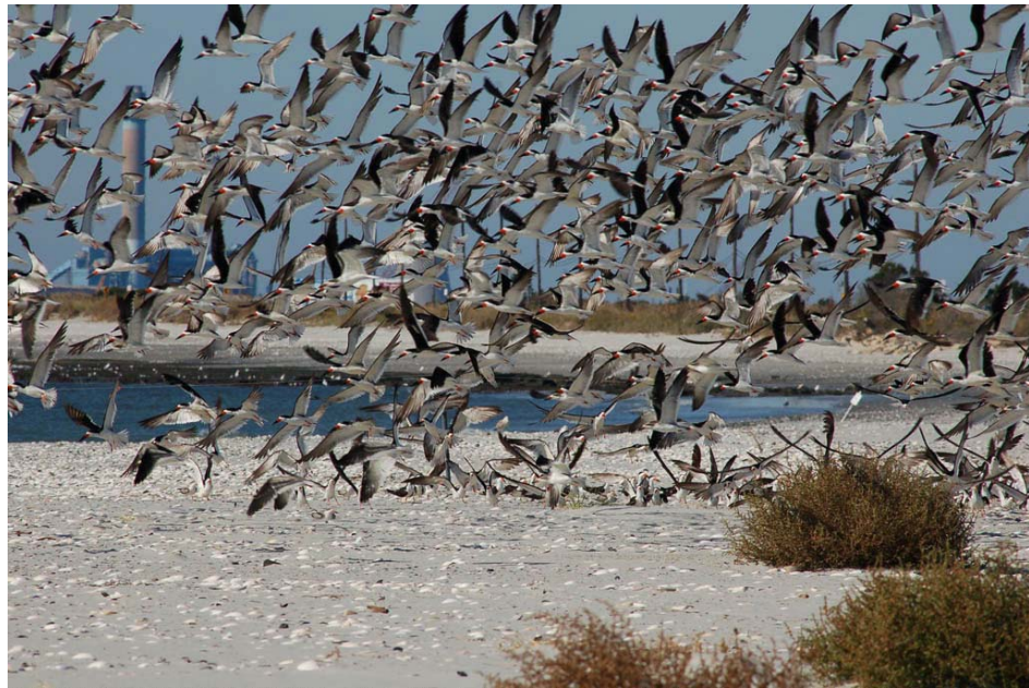
Picture 2: Black Skimmer COLONY - Malibu Beach - Longport Sodbank - 10-10-08

The River Council plans a significant investment in avian science and research this year to produce a summary report of the last 5 years of collected data and expand the past winter surveys to include spring and fall migration data and summer breeding data. Winter Raptor and Waterbird Survey Reports for the Great