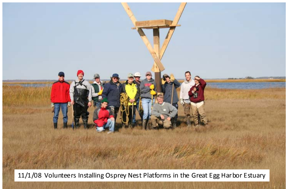
11/1/08 Volunteers Installing Osprey Nest Platforms in the Great Egg Harbor Estuary

The B.L. England Generating Station provided a $2,000 grant to the River Council and a smaller grant to Troop 55 to help cover the costs of materials and transportation. Brooke Koeneke donated the use of his Duke-O-Fluke 45 foot pontoon boat to get the volunteers out to the estuary. Conservation Resources, Inc. also promoted the project on their website.