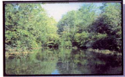
Pictured Above: The Wild & Scenic Great Egg Harbor & Maurice Rivers