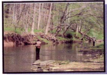
Pictured Above: The Lamprey River & White Clay Creek Wild & Scenic Rivers

The Farmington River (14 Miles Designated) ~ Bordered by state parks and forests, the Farmington River Valley is currently the only place in the state that is home to nesting bald eagles.