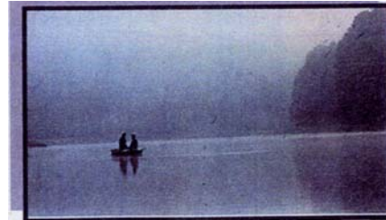
Pictured Above: The Wild and Scenic Assabet & Farmington Rivers