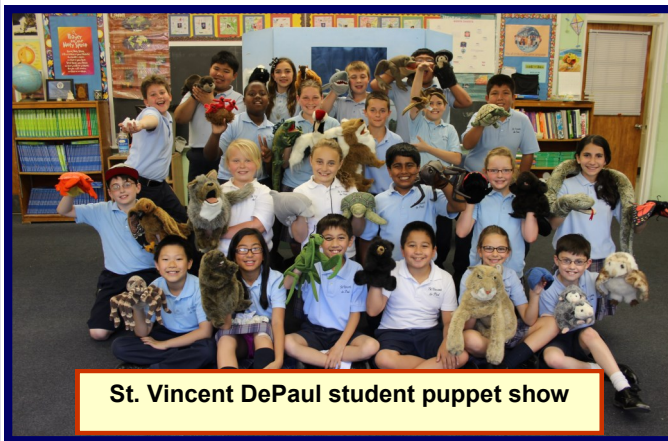
St. Vincent DePaul student puppet show

We offer our environmentally focused programs free of charge to augment existing school curriculum. A school's environmental programs are often threatened when faced with annual budget cuts. If you are a parent, and/or an educator, and feel our programs would enhance the environmental education that your child/student is receiving, please contact the appropriate individual in your school and request that they take advantage of the Great Egg