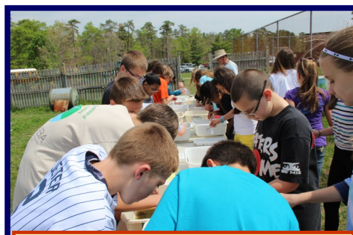
Students from Alder Avenue School searching for macroinvertebrates