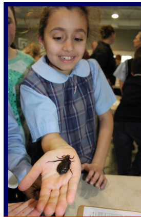
Student holding a Dragonfly Nymph

REMEMBER our environmentally focused programs are FREE!