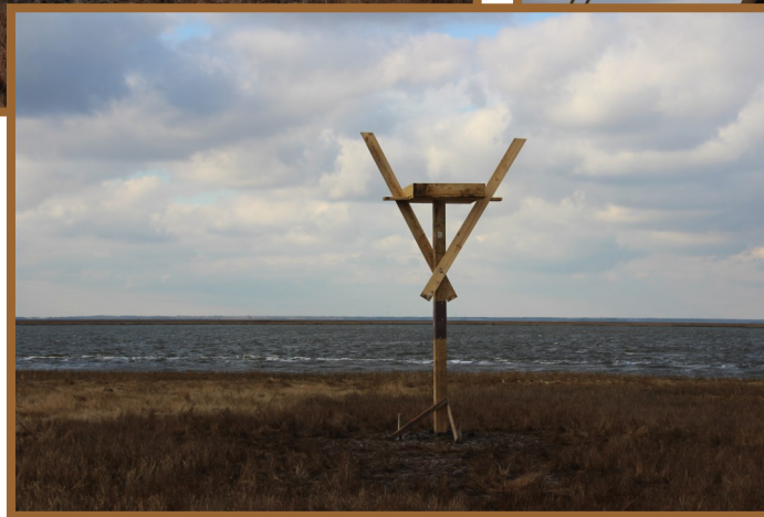
New Osprey Platform Installed at Beesleys Point January 2023