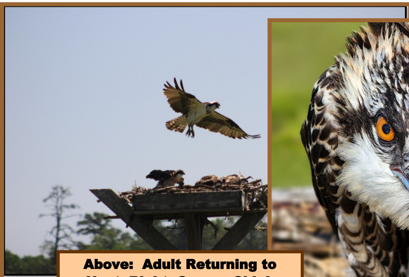
Above: Adult Returning to Nest, Right: Osprey Chick Close to Fledging

This was not the case with the osprey nests west of the Parkway Bridge on the Great Egg and Tuckahoe Rivers. Of the 48 nesting platforms monitored by the GEHWA/GEHRC Osprey Project, 31 were active with a total chick count of 68. It would seem that the nests west of the parkway were just inland enough to be protected from the strong coastal winds that had a negative impact elsewhere.