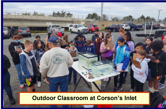
Outdoor Classroom at Corson's Inlet

We offer our environmentally focused programs free of charge to augment existing school curriculum. A school's environmental programs are often threatened when faced with annual budget cuts. If you are a parent, and/or an educator, and feel our programs would enhance the environmental education that your child/student is receiving, please contact the appropriate individual in your school and request that they take advantage of the Great Egg