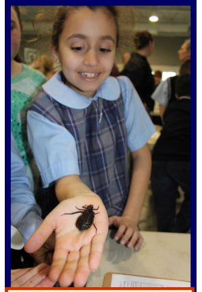
Student holding a Dragonfly Nymph