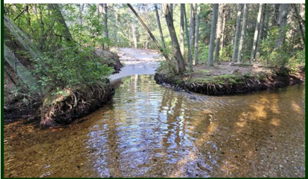
ATV Damage to the Banks and Bed of Gravelly Run 9/17/22