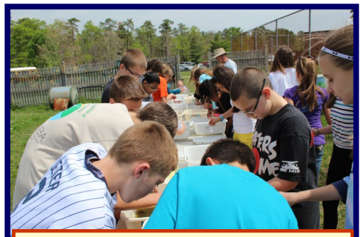
Students from Alder Avenue School searching for macroinvertebrates

REMEMBER our environmentally focused programs are FREE!